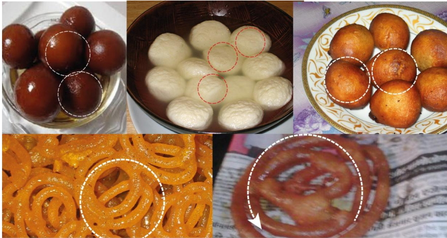
Fig 8: Orissan traditional popular Foods.