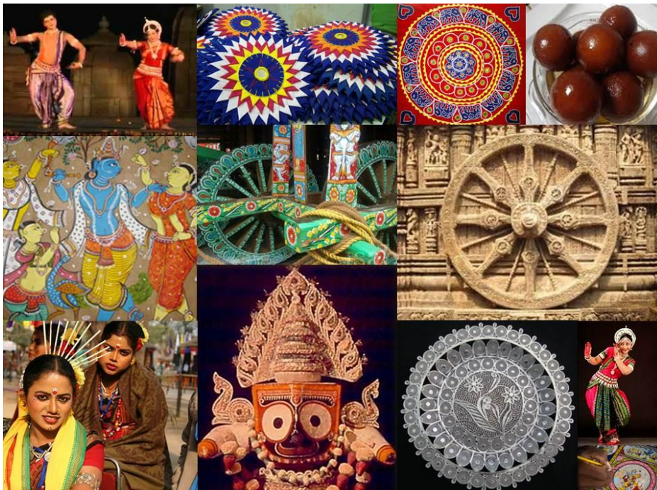
Fig 2: A glance of Orissan culture.

Since my root is based in Orissa, India, so I have to bring out to the world audience some notable aspects from Orissan (Oriya) script - one of Indian writing systems as it is part my research process. The Spectrum of Indian Typography is very vast ranging from Devnagari to various regional scripts. When we talk about Orissan Typography in particular as one of Indian scripts especially in outdoor context, it becomes an asset to the Orissan culture, by embracing lot of layers & forms of decorative values, motives and various folk forms of its rich cultural and political backgrounds