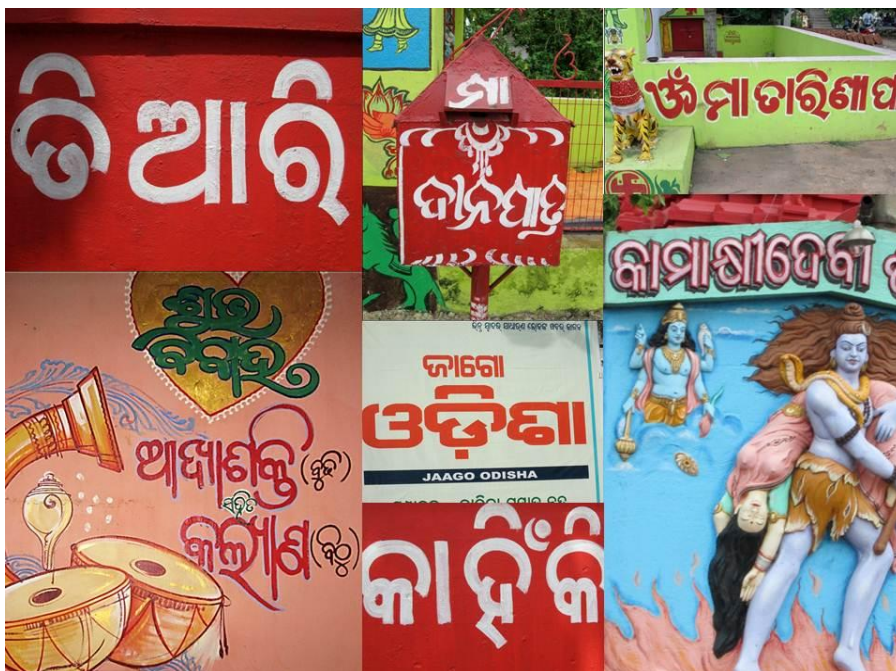
Fig 3: A glance of Orissan environmental typography.

value. This aesthetic value may consist of cultural and environmental reflections. As part of my academic research, I came across a lot of environment typographical element reflecting the vernacular visual language associated with deep cultural base. Evidence shows Oriya script consists of rounded shapes quite similar to south Indian counter parts. That is because of the ancient Orissan writing process was being scratched on palm-leave manuscripts by means of a sharp stylus. Practically it was easier to write rounded strokes as there was risk of tearing the leave in case of straight strokes. In linguistic aspect, it has much similarity with other northern Indian languages like Hindi, Bengali and Gujarati. On closure look, you can find the upper part without shiro-rekha (Horizontal line at top unlike Devnagri) with the curvilinear stroke similar like southern. But in bottom part it has similarity with Devnagri scripts. That 'curvilinear' or circular part would be my prime focus of my analysis in the presentation. Is there a practice on circular forms established in all forms of Oriya cultural, folk arts and crafts?