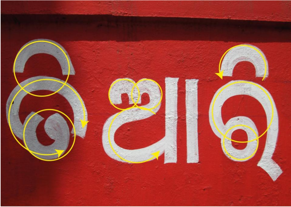
Fig 10: The Orissan script is strongly based on Circular structure. Is it the cultural reflection?

understanding with the Orissan environmental and outdoor typography which is now on helm of negligence and under cover with respect from the scope of future design education. The presentation and paper is based on one ongoing academic research project and shows the attempt of investigating the relation between visual and verbal aspects of such traditional expressive writing systems in certain environments.