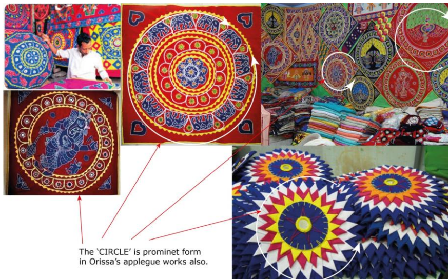
The 'CIRCLE' is prominent form in Orissa's appliqué works also.