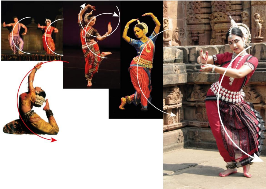
Fig 4: Circular forms in Orissan Dance (Odissi).

craftsmen to produce such design forms. About the circular forms in particular which I have discovered is clearly a common visible element in entire Orissan culture associated in many ways. (Please see the Fig 4 – Fig 10)