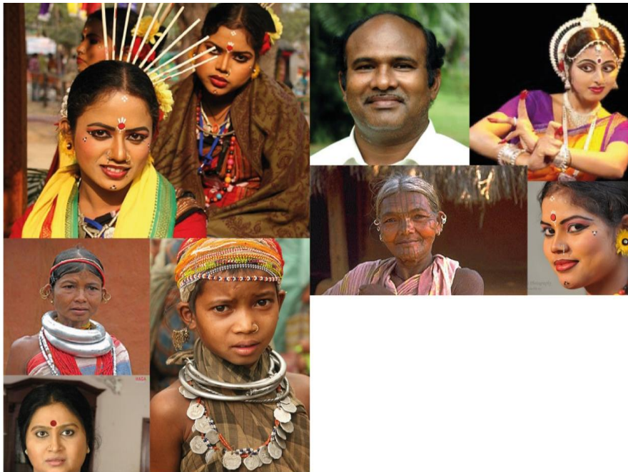
Fig 9: Traditional costumes and jewelry of Orissan people with circular elements

where, they have to indicate the fundamental understanding and knowledge of its cultural connections. One leading question will be: how is it possible to convey knowledge about aesthetic principles of this environmental typo form in a vernacular backdrop without knowing a language?