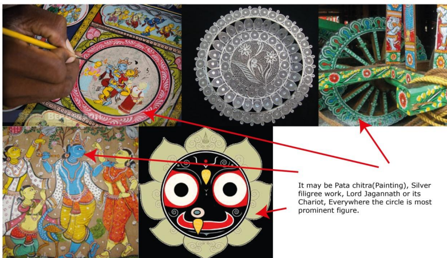
It may be Pata chitra (Painting), Silver filigree work, Lord Jagannath or its Chariot, Everywhere the circle is most prominent figure.